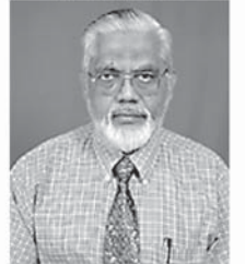
Damodarapuram Residents welfare Association Besant Nagar

BE (Hons) MSc (Eng) PhD (IITM) Vice President