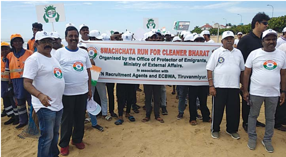
▲ The Ministry of External Affairs (Govt of India) in association with ECBWA conducted a beach cleaning programme on Oct.1 at Thiruvanniyur beach. About 400 volunteers from the Ministry of External Affairs (Govt of India) and East Coast Beach Walkers Association (ECBWA) participated in the Swachh Bharat Rally and Mega cleaning work.