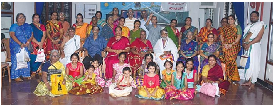
▲ The Adyar unit of Tamilnadu Brahmin Association celebrated Navaratri on Oct.20 at Yogalaya, Gandhi Nagar, in a grand manner. They conducted Ganesha pooja, Devi pooja, dhampathi pooja, sumangali pooja and kanya pooja, after which sarees and pavadai sets were distributed to 32 people. A bhajan program was also organised by Gana Smriti Bhajan Mandali, Adyar.