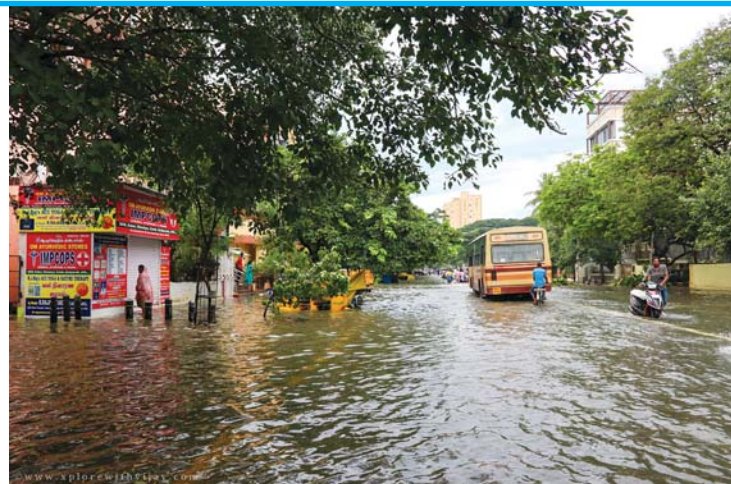
▲ A live view of the havoc at MG Road, flooded by Michaung. ◀ An aerial view of cyclone Michaung looming over Elliot's beach as it arrives to create havoc in the city.