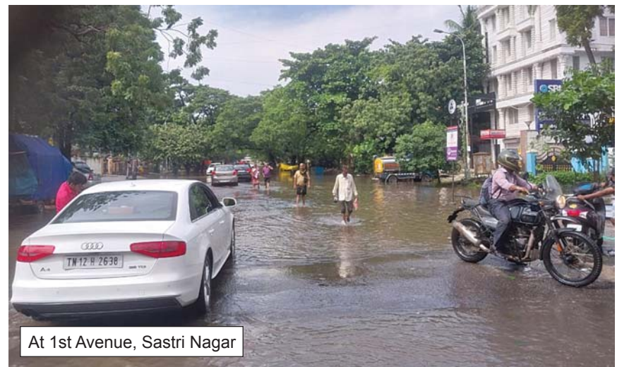
At 1st Avenue, Sastri Nagar

● Gradient not leading to SWDs: Improper gradient of the roads away from the SWD also led to inunda-