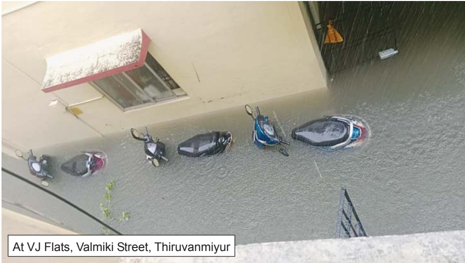
At VJ Flats, Valmiki Street, Thiruvanniyur