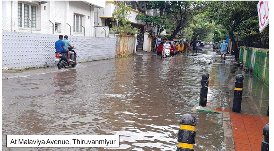
At Malaviya Avenue, Thiruvanniyur