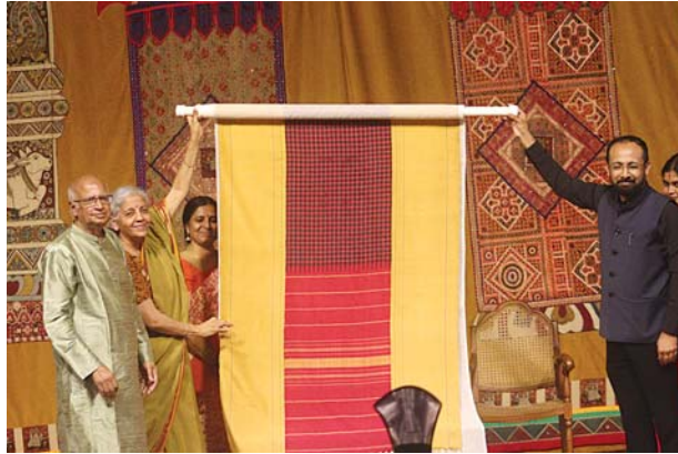
Minister Nirmala Sitaraman unravelling one of the sarees of Rukmini Devi.

Describing her experience, the minister said, "Rukmini Devi was a leader and a cultural ambassador. Words are inadequate to describe her contribution and her worldwide vision. Kalakshetra breathes and speaks Rukmini Devi. She has made a huge impact on me that is more than enough for me to keep me rooted in my