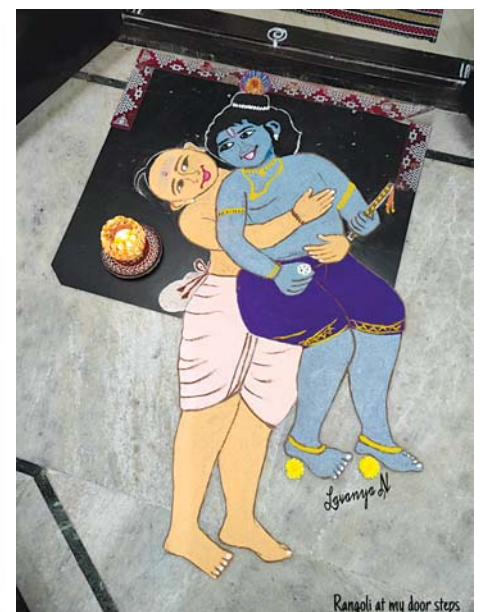
THE BEST FRIEND OF SUDHAMA IS OUR BEST FRIEND TOO... KUCHELA DINAM