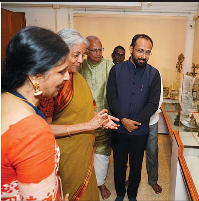
(Photo left) Union Minister of Finance and Corporate Affairs, Nirmala Sitharaman, laid the foundation stone for the extension of the block of the Rukmini Devi Museum at the Kalakshetra campus, on Nov.29. (Photo right) The minister going through the artefacts at the Rukmini Devi Museum. More on Page 3.

ADYAR TIMES Pongal issue will be published on Jan.13 (Saturday), instead of Jan.14 (Sunday). Advertisements booking will close on Jan.11 (Thursday) at 5 pm.