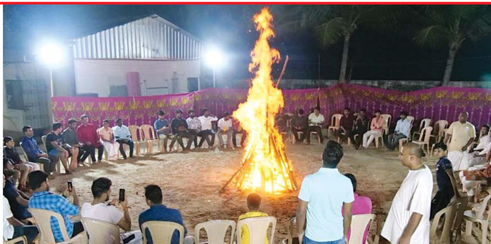
Hare Krishna Movement, Thiruvannamiyur celebrated Pongal with great fervour. Each person wrote down one bad habit they need to give up, on a chit of paper, and dropped it into the bonfire. This was a unique event which expresses the real significance of the bonfire ritual. More on page J2.