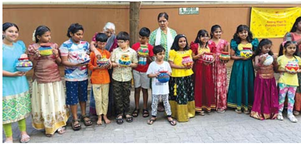
▲ Kottur Villa Owners Welfare Association (KVOVA), celebrated Pongal at their campus with many competitions - kolam, pot painting etc., for kids and women. They also conducted a 'Gau' pooja on their campus.