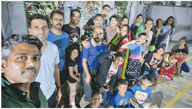
▲ The Pongal celebrations at KGEYES Eternity, Parvathi Street, Kalakshetra Colony, Besant Nagar, brought together residents in a spirit of unity and festivity. From traditional Pongal pot decorations to vibrant cultural performances, the community showcased the richness of our cultural diversity. Families joined hands in preparing delicious Pongal dishes, fostering a sense of camaraderie.