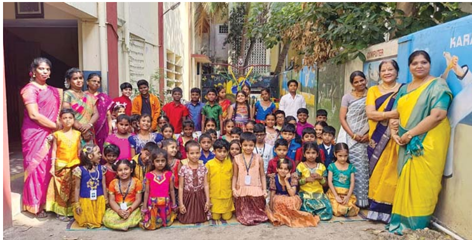
◀ Chithkala Nursery and Primary School celebrated Pongal with the children of the school.