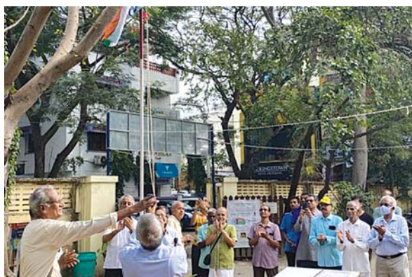
◀ Republic Day celebrations at the Kasturba Nagar Residents Association hall by the residents of Kasturba Nagar, Adyar.