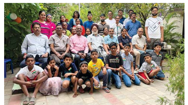
▼ Republic Day celebrations at Bay View Apartments, Parvathi Street, Besant Nagar.