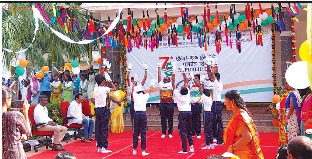
Children participate in the Republic Day celebrations giving a good show of a variety of programmes. (L) Children from Chennai High School, Kamaraj Avenue; (R) Children at NIEPMD. More on page 4.