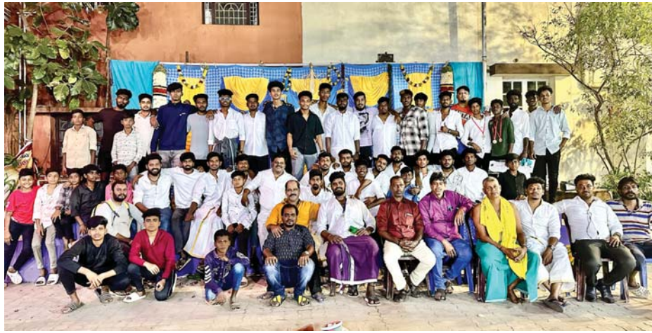
◀ Thiruvalluvar Nagar Youth Club, Besant Nagar organised a grand pongal celebration. Many young people and kids actively participated in these activities, thereby creating a more social environment. They also organised many talent display activities like Thirukkural recitation, drawing, singing, dance, kolam and sports competitions and encouraged them with lots of prizes.