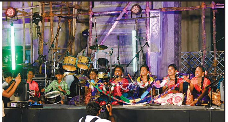
After a hiatus of 6 years, the Urur Olcott Kuppam Vizha came to life on Feb.23. The Vizha exhibited the talent of the local community, including the children from Avvai Home and Olcott High School, who presented Parai Oorvalam and Villu Paatu respectively. More on page 4.