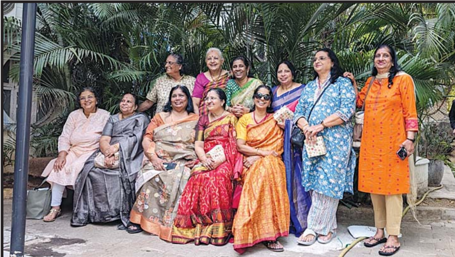
▲ Girls of '72 Batch of Rosary Matriculation School met to celebrate Women's Day at Gandhi Nagar. It was a day of exchanging nostalgic memories of the school and gifts for each other. A few were meeting their classmates after 52 years.

ADYAR TIMES contact numbers : Edit Desk : 73585 31212 Advt. Desk : 97910 19000 Line Advt. Desk : 89397 73679 Circulation : 98411 30147, 93426 13877