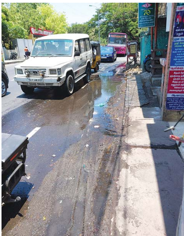
▲ On LB Road, there is always sewage water leak and stagnation on the stretch from opposite IMPCOPS to The Plutus Residence entry gate. Request concerned authorities to look into it and take action.

The book is priced at Rs.995 and has been published by Ashish Books, New Delhi. The publisher can be contacted at aphbooks@gmail.com.