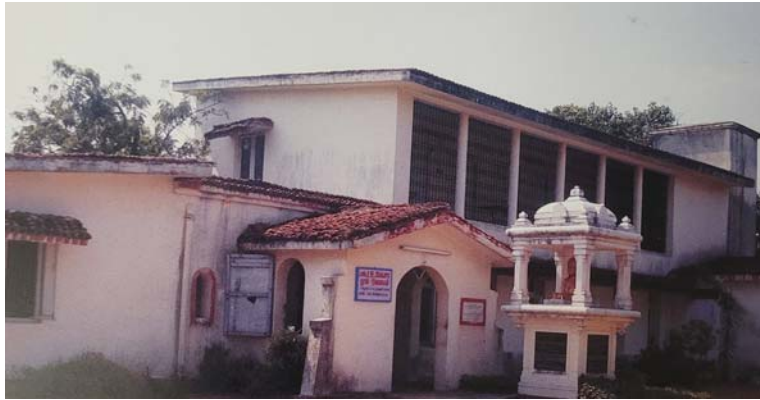
U.Ve.Swaminatha Iyer library at Kalakshetra.

28th April happens to be the death anniversary of U.Ve.Swaminatha Iyer. Do Adyartites know that a library of the collections of this great man is in our midst? When you enter the Besant Theosophical School gate on Arundale Beach Road in Thiruvannamiyur, you head straight. On the right ahead is a treasure trove of U.Ve.Swaminatha Iyer.