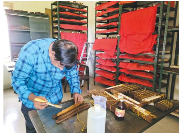
▼ Palm Manuscripts being treated at the library