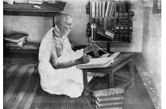
▲ U.Ve.Swaminatha Iyer studying the palm manuscripts