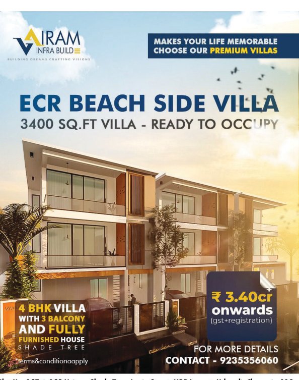
Plot No. 107 & 108 Vairam Shade Tree, Lenin Street, VGP Layout, Uthandi, Chennai - 119.

■VETTUVANKENNI Seaside land 2800 east facing and new flat 2 bedroom, hall, kitchen, north facing 1200 buildup. Palavakkam right side 1200 sft. 600 sft. 9884366675.