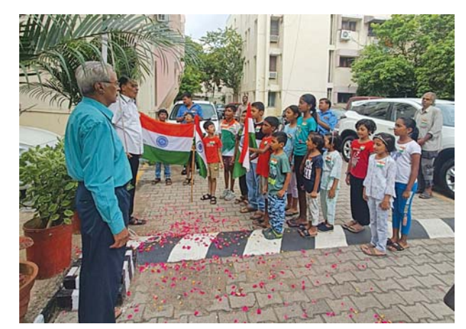
▲ Independence Day celebrations at Riverdale Apartments, Kotturpuram.