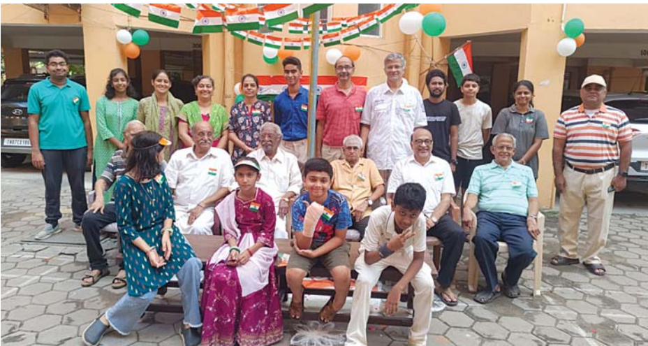
▲ Independence Day celebrations at Deccan Enclave, T.M.Maistry Street, Vannanthurai.