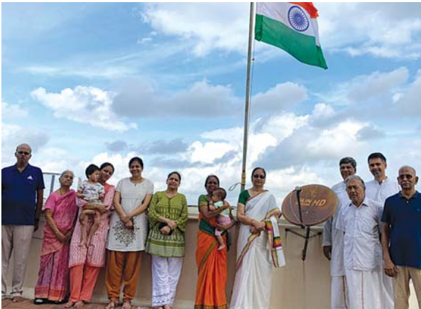
▲ Independence Day celebrations at Sampooran Apartments, Thiruvanniyur.