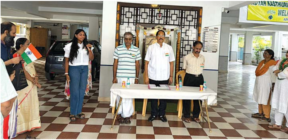
▲ Independence Day celebrations by Adyar Kasturba Nagar South Residents' Welfare Association.