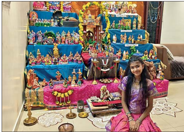
▲ S.Pratiksha: Model of Vaikuntha Ekadashi and paramapada vaasal were presented.