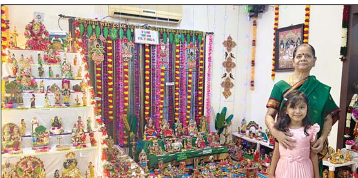
◀ Usha Mukund: Concept was 'Valam tharum Virathangal'. More than 40 virathangal were portrayed through intricate and colourful dolls.