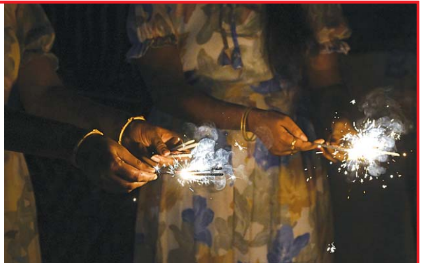
Diwali was celebrated with great splendour, just like every other year. Pedestrians and vehicles had one more temporary hurdle - bursting of sara vedi, flower pot fountain and excited youngsters running across the roads to set off more fireworks.