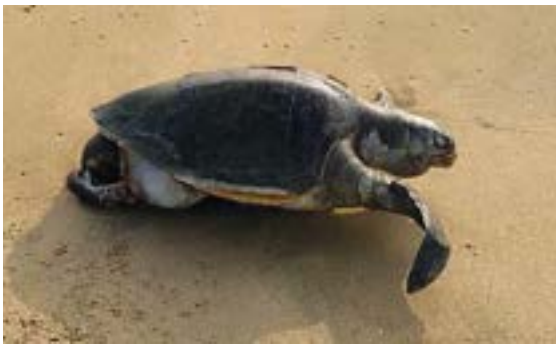
A dead turtle washed ashore at the Thiruvanmiyur beach.

The Olive Ridley Sea Turtle breeding season, beginning in December marks a crucial time for conservation along India's coastline. During this period, TREE Foundation, with the support of the Forest Department, actively safeguards nesting turtles and their eggs. The Sea Turtle Protection Force Members patrol village beaches, ensuring these endangered creatures are pro-