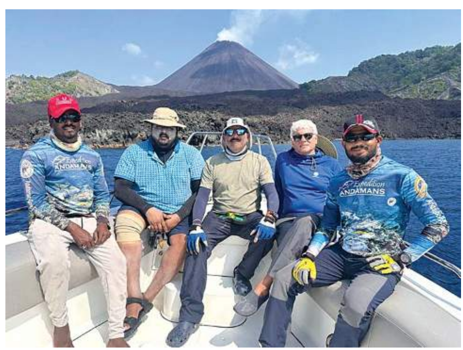
▲ Sport fishing team at Barren Island.

Big-game sportfishing, also known as offshore or deep-sea fishing, is a sport that involves catching large fish species using specialised fishing rods and reels. Sports fishermen use artificial lures and hand-held rods. This sport requires skill, patience, and endurance, as the targeted fish are strong and often put up a challenging fight. All the fish caught are safely released back into the ocean.