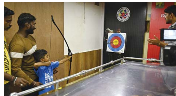
▲ A student takes aim as a tribute before bidding their master a final goodbye.