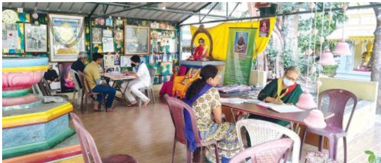
▲ A free medical camp was conducted on June 7 at Sri Sakkarai Amma temple, Thiruvaniyur, by Thiruvaniyur Sai Samithi in collaboration with Chettinad Medical College.

▼ The devotees of Adiparasakthi Siddhar Peedam, Melmaruvathur, residing in and around Besant Nagar, conducted Annadanam for more than 150 people on May 24. They conduct the annadanam every alternate month after a small pooja, at Besant Nagar 7th Avenue.