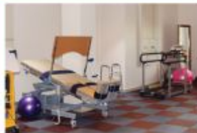
PHYSIO &amp; REHAB