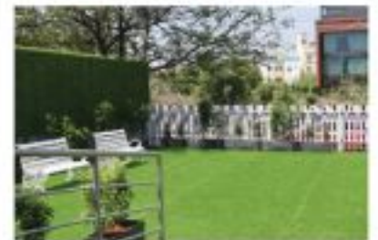
BRIGHT &amp; OPEN ELDER GROVES