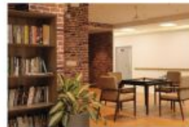
MIND &amp; MEMORY LOUNGE