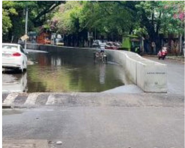
■ The residents of Besant Nagar are stunned and clueless