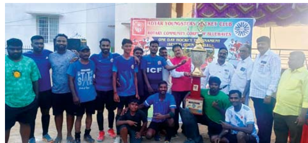
▲ Rotary Club Blue Waves and Adyar Traders Association jointly conducted a hockey tournament at Besant Nagar on Aug.15. Teams from all across the city participated. The Adyar (A) team won against Loyola College in the finals.