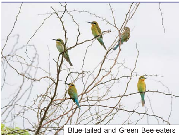
Blue-tailed and Green Bee-eaters