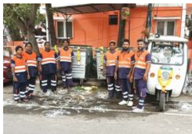
▲ Celebrating their daily work: Conservancy workers of Urbaser Summit decorate the place of the bins for 'Ayutha Puja' at Venkatrathnam Nagar, Adyar, on Oct.1.