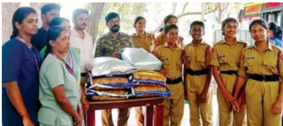
▲ Marking the start of Christmas celebrations, 30 students and staff members from St. Michael's Academy, Adyar, visited RMD Samarpan - The Care Point on Dec. 1. The students spent time interacting with the inmates and donated essential groceries and medical supplies to the facility. RMD Samarpan specialises in providing care for bedridden patients and the elderly. Ph: 93810 16588.