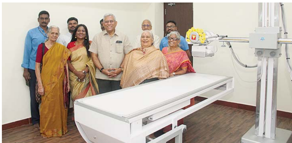
▲ Durgabai Deshmukh General Hospital, managed by Andhra Mahila Sabha, on Dec.17, inaugurated a state-of-the-art digital X-ray machine in its Orthopaedic Department. The new diagnostic system utilises advanced imaging technology to provide high-resolution results with significantly faster processing times, for more precise treatment in orthopaedic cases.