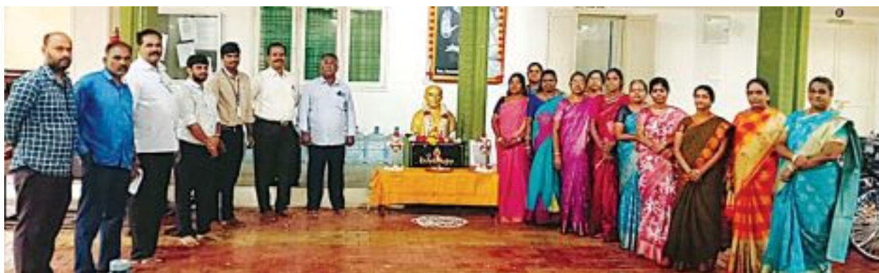
▲ Students and staff of Besant Theosophical Higher Secondary School, Besant Nagar (Kalakshetra Foundation), pay tribute to the visionary educator, Dr. George Arundale, during a special assembly marking his birth anniversary on Dec.1. The campus celebrated his ideals of discipline, service, and holistic learning.

Call for assistance 97910 19000 or mail to adyartimesads@gmail.com