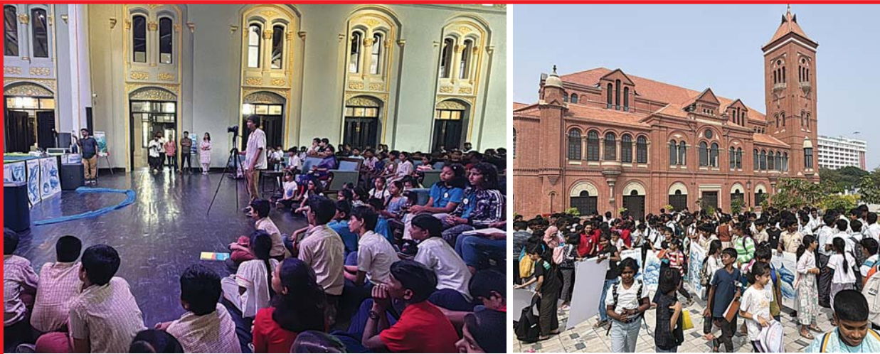
Students participate in interactive sessions on marine conservation during the Chennai Ocean Workshop organised by EFI, HCL Foundation and Greater Chennai Corporation at Victoria Town Hall on January 29. The inaugural session brought together 200 students from 20 schools across the city for a five-hour intensive learning experience.

ADYAR TIMES contact numbers : Edit Desk : 73585 31212 Advt. Desk : 97910 19000 Line Advt. Desk : 89397 73679 Circulation : 98411 30147, 93426 13877