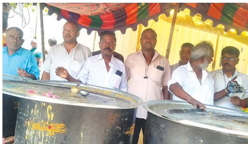
▼ Annadhanam by Adyar M.G. Road Real-Estate Nanbargal on March 30 on the occasion of Panguni festival at Marundeeswarar temple.