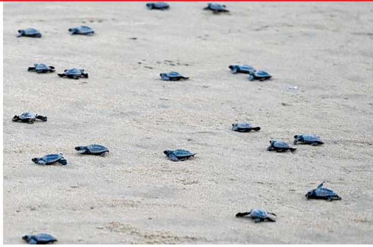
Tiny Olive Ridley Turtles racing to the ocean, at the Besant Nagar beach after their incubation and hatching at the hatcheries, by the concerted efforts of Govt. agencies and volunteers. More on page 3.