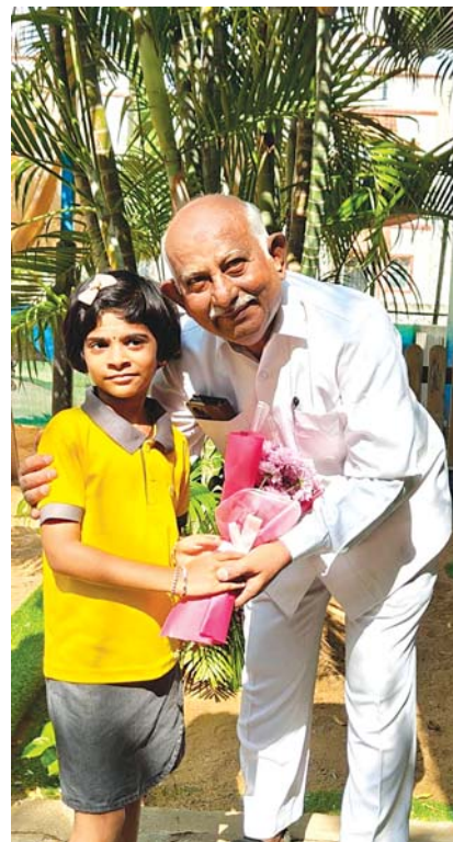
▲ The Thiruvanniyur branches of Kidzee (Kannappa Nagar and Valmiki Nagar) recently hosted a vibrant Science Expo, showcasing the ingenuity of their youngest learners. Students from Nursery to Senior KG participated as 'Little scientists', presenting a variety of innovative models and live demonstrations. The exhibition provided an enriching platform for future innovators to build confidence and share their bright ideas with the community. For admission inquiries, the school can be reached at 98843 00080 or 98842 00080.