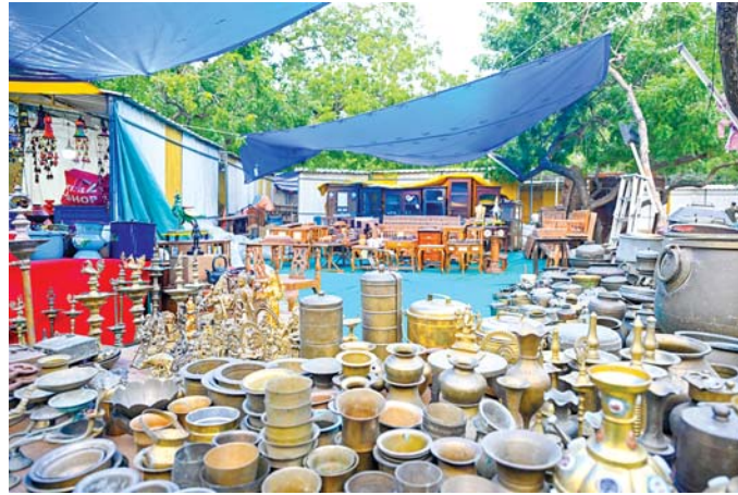
At the CERC Campus Exhibition Ground, Kalakshetra Road, Thiruvanimiyur. For details, contact 78291 70001 or 96203 36910.

The event promises a vibrant shopping and cultural experience for families and craft enthusiasts alike.