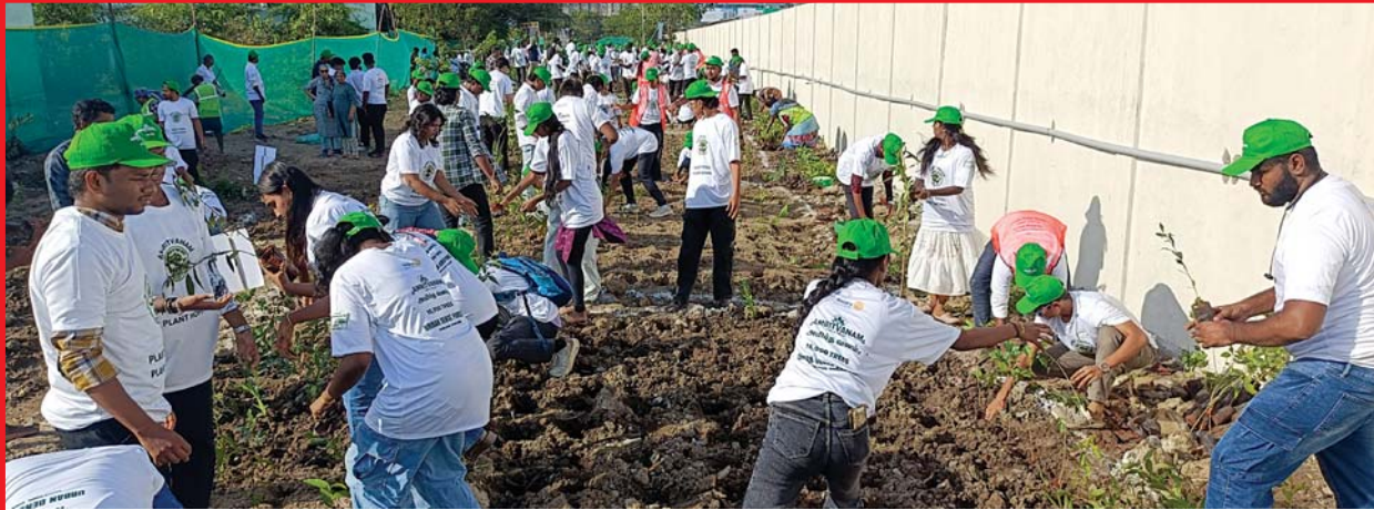
Volunteers plant saplings as part of a massive 15,000-tree afforestation initiative, at the University of Madras, Taramani Campus, on World Environment Day (June 5). Themed 'Amrit Vanam - Lungs of the City', the event was organised by Rotary International District 3234 in collaboration with the Green Tamil Nadu Mission and local Rotary clubs to expand the city's green cover. More on page 3.

ADYAR TIMES contact numbers : Edit Desk : 73585 31212 Advt. Desk : 97910 19000 Line Advt. Desk : 89397 73679 Circulation : 98411 30147, 93426 13877